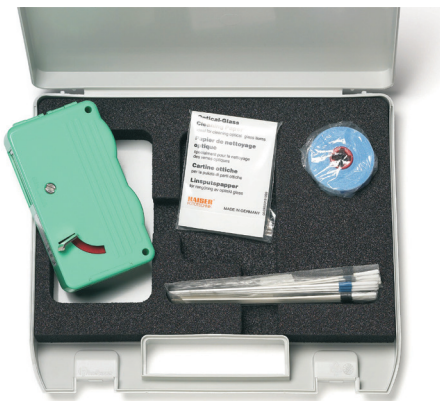
OCK-10 Optical Connector Cleaning Kit (accessory)